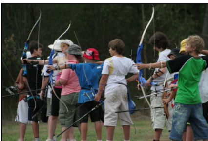
The junior archers, outdoors