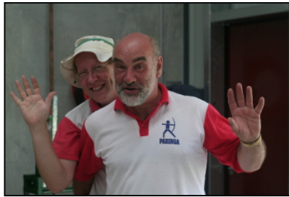
2 Tasmanian heads are better than 1?