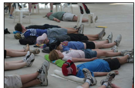
The meditating juniors

While the camp was an intense week of archery, it was presented in a structured yet fun learning environment. There were three 2 hour archery sessions a day, either outdoors or utilising the indoor facility on location. As a bystander it was encouraging and at times inspirational to watch and observe the archery youth, and later the seniors, absorb the knowledge and instruction being passed onto them by the coaches. While technique was a focal point for every individual archer, the coaches gave a holistic approach to the sport, including other areas such as buying the right equipment, maintenance of bow and arrows, running repairs, arrow making and looking after the well being of the archer in mind, body and spirit.